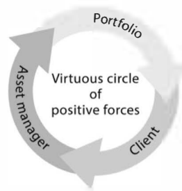
Figure 3: Virtuous Circle of Positive Forces

If this circle works as planned, organizations' business outcomes are likely to improve over time. Thus, the circle makes a compelling case for organizations to foster a culture of professionalism.